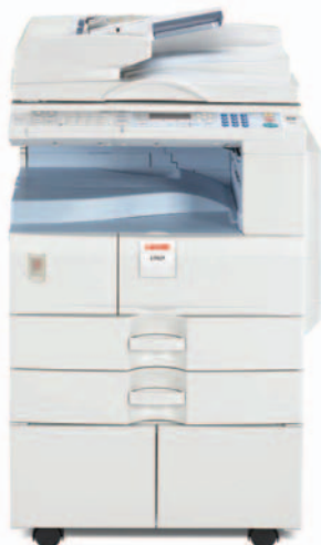
LD125 Copier Model*