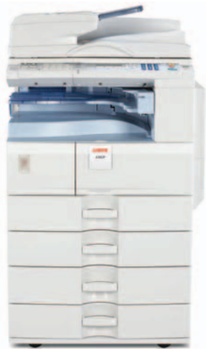
LD125 Standard Scan/Print/Fax Model*