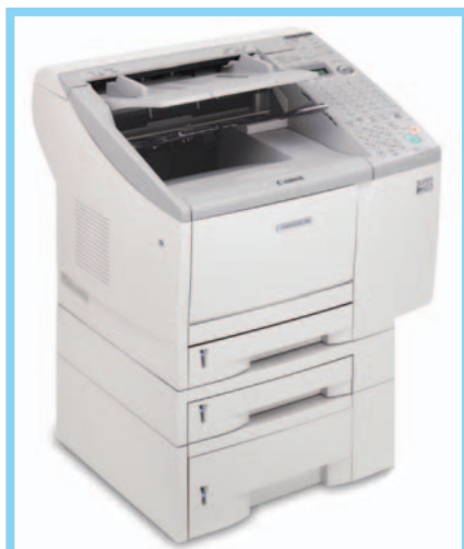
The LASER CLASS 700 Series, shown with maximum paper capacity of 1,100 sheets.

†† Based on ITU-T No. 1 Chart (Standard Mode)