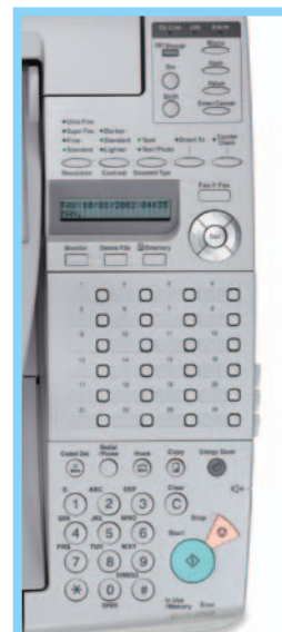
The user-friendly control panel makes all functions easily accessible.