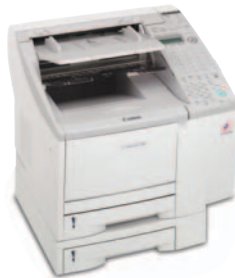
LASER CLASS® 730i