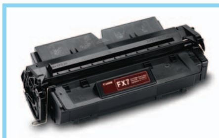
The FX7 Cartridge produces up to 4,500 prints at 5% image coverage, and makes maintenance a snap.