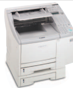
LASER CLASS® 710